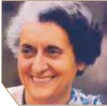
Indira Gandhi Former Prime Minister

"When one sees such tremendous work, one often does not get the right word to express happiness. I can only state that this is the work of men of imagination, vision, enthusiasm and drive which is the greatest need."