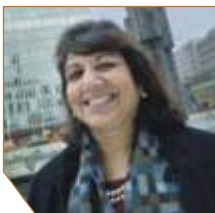
Kiran Mazumdar Shaw CEO, Biocon India

"Of the nearly 50,000 doctors of Indian origin in America, more than 2,000 are from KMC."