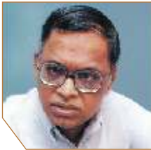
NR Narayana Murthy Chairman of the Board and Chief Mentor, Infosys Technologies Ltd.

"Manipal is like the Nalanda of yore. I am happy to see engineering, medicine and other disciplines being taught in the same campus, an ideal environment for research to flourish."