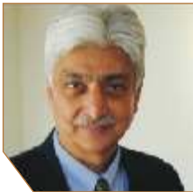
Azim H Premji Chairman, Wipro Technologies Ltd.

"State governments should concentrate on primary education. They need not be burdened with higher education. The achievement of the private sector in higher education is best illustrated by Manipal, which is the Harvard of India."