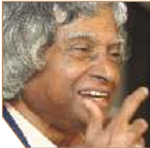
Dr APJ Abdul Kalam Former President of India

"When one sees such tremendous work, one often does not get the right word to express happiness. I can only state that this is the work of men of imagination, vision, enthusiasm and drive which is the greatest need."